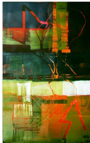
Time Warp #100 Shoalwater Cove Gallery