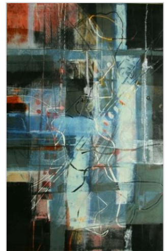
Trail Map #96 RiverSea Gallery

You can also find my artwork at Just Imagine in Russell, New Zealand and at the Port of Ilwaco, Washington at Shoalwater Cove Gallery .