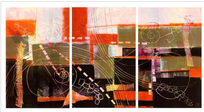
Life Journeys Times Three Collection Lyrical Gardens I, II, III #153-5 Just Imagine